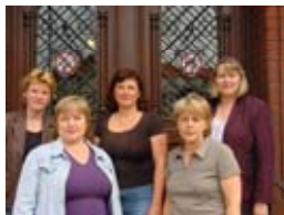
5 local offices